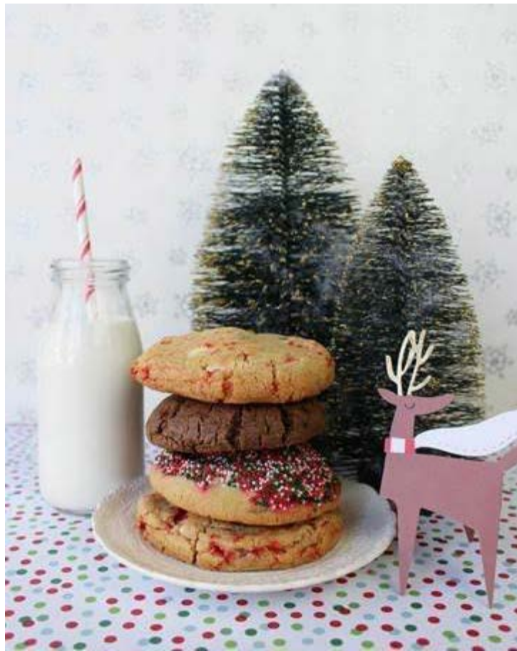
Milk Jar Cookies

All of the cookies are handmade from scratch and baked fresh all day, every day. Crisp on the outside and doughy in the middle, with flavors ranging from classic chocolate chip to adventurous banana split, you'll find just the treat for any sweet tooth.