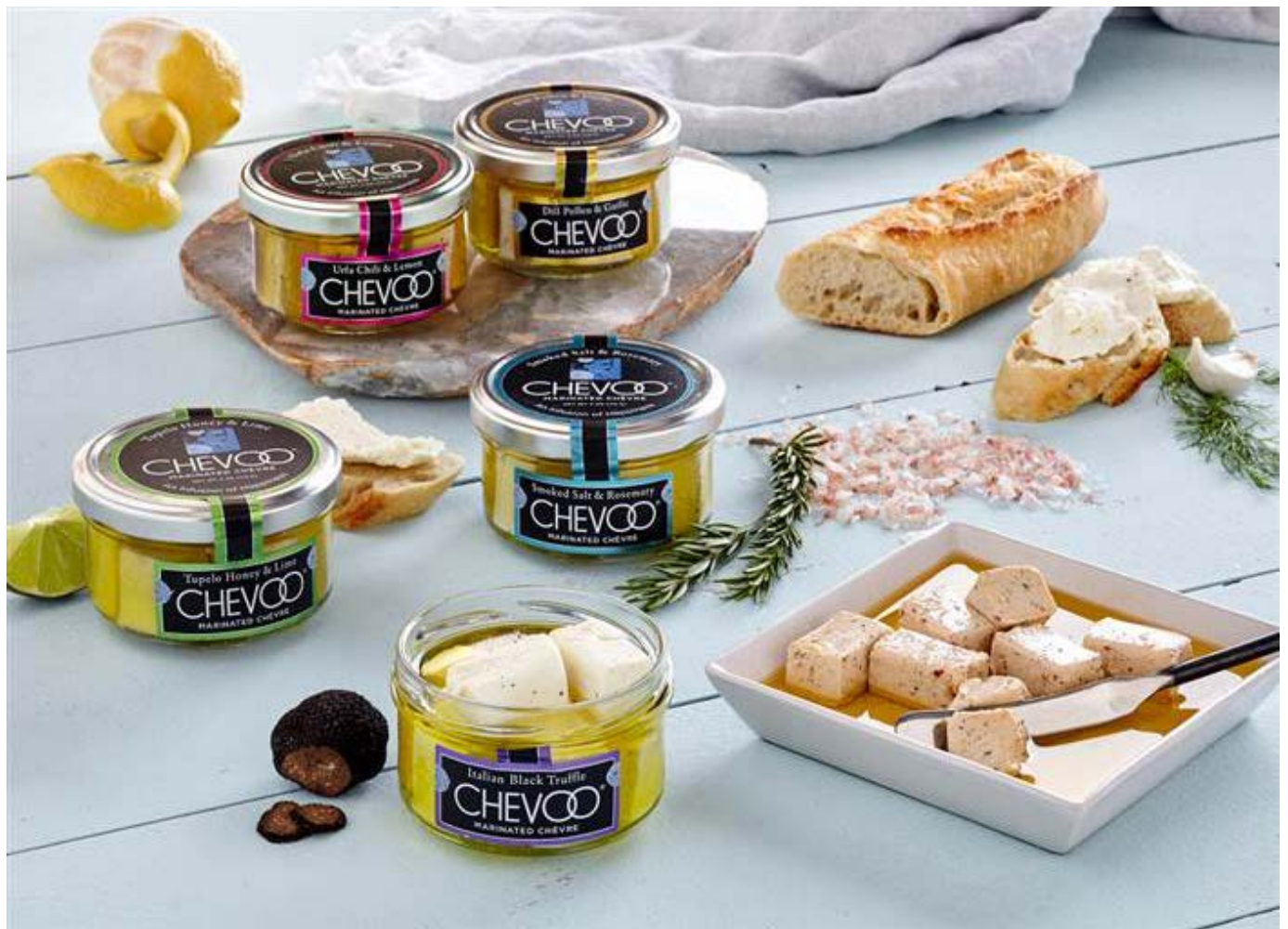
CHEVOO / Cowgirl Creamery

Marinated goat cheese is a delicious new trend in cheese. CHEVOO is made from small cubes of pasteurized goat cheese that is marinated in flavored oil. This collection includes all five CHEVOO cheeses: Smoked Salt & Rosemary, Dill Pollen & Garlic, Urfa Chili & Lemon, Tupelo Honey & Lime, and Italian Black Truffle.