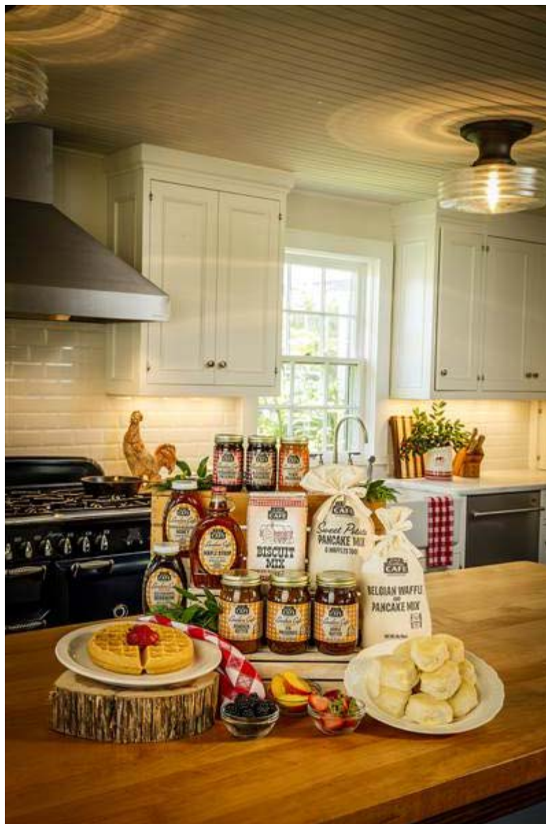
The Loveless Cafe

The Loveless Cafe's Biscuit and Waffle Bar gift set has everything you need to feed the whole family. It includes biscuit, waffle and sweet potato pancake mixes, syrup, butters and preserves. Anyone can experience an authentic taste of Nashville this holiday season with the essentials to make your own Southern biscuits and waffles.